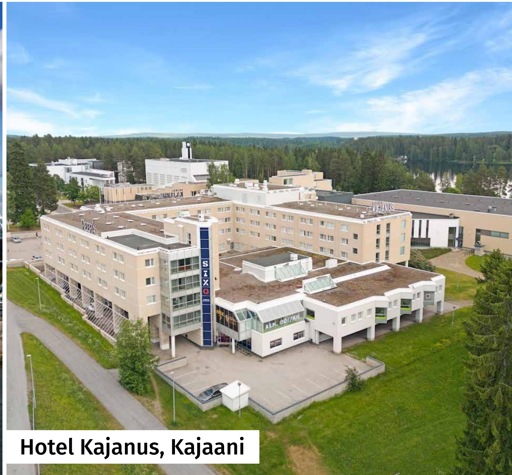
Hotel Kajanus, Kajaani