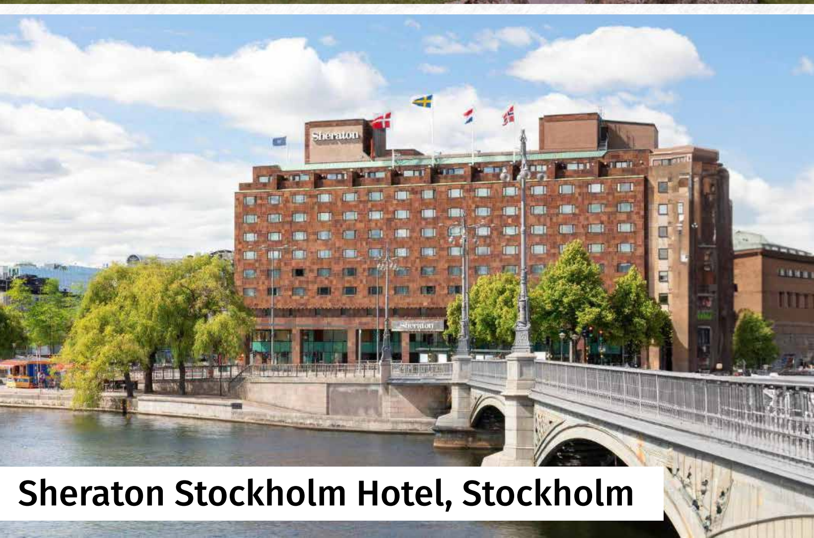
Sheraton Stockholm Hotel, Stockholm