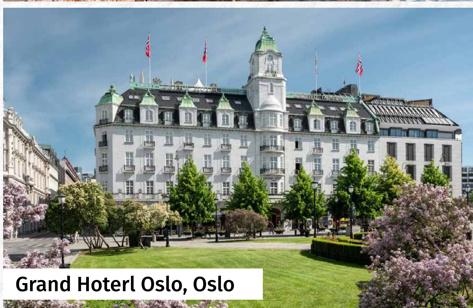
Grand Hotell Oslo, Oslo