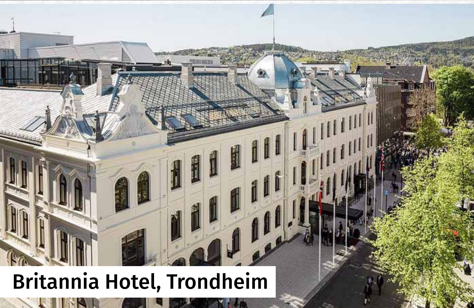
Britannia Hotel, Trondheim