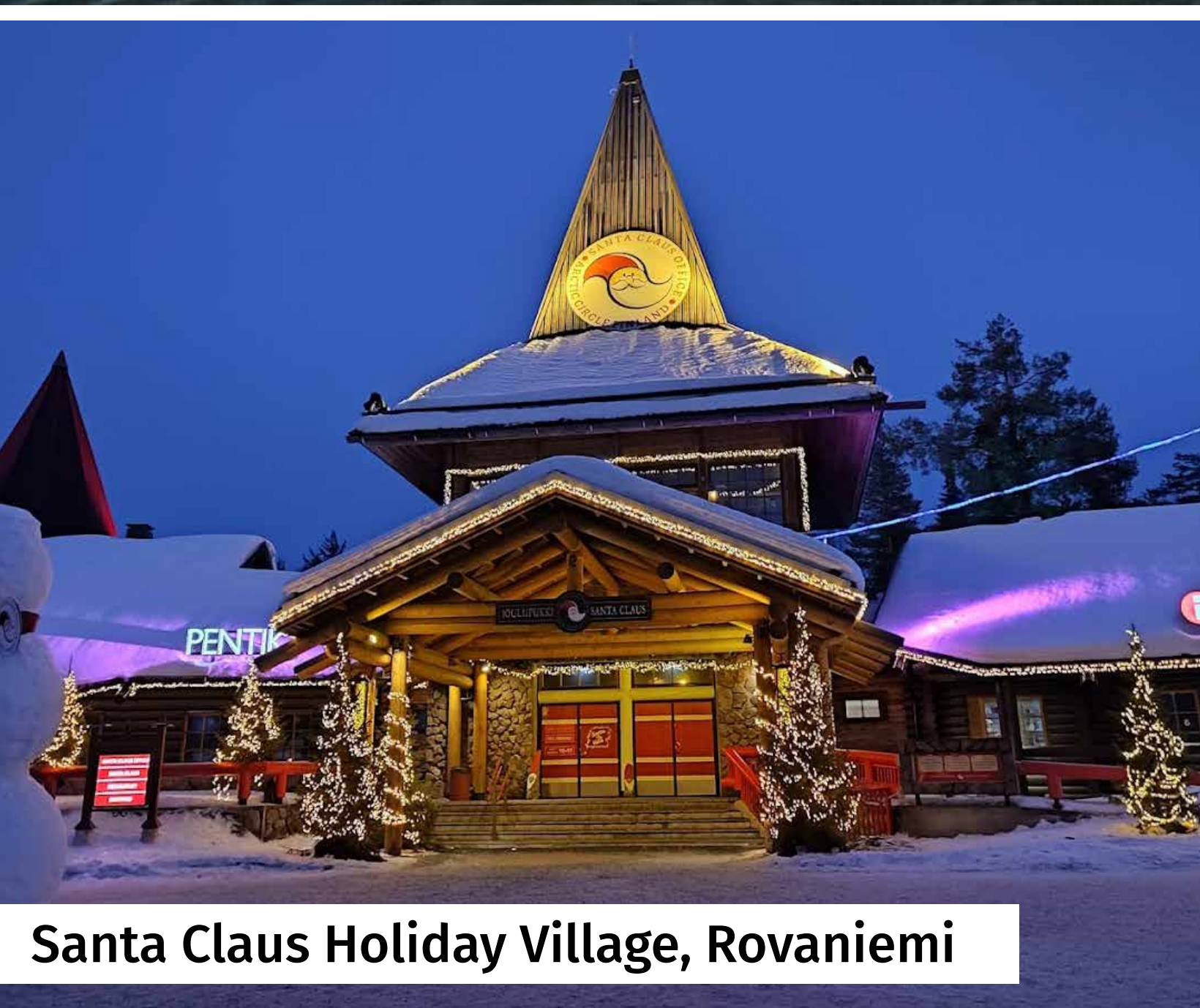
Santa Claus Holiday Village, Rovaniemi