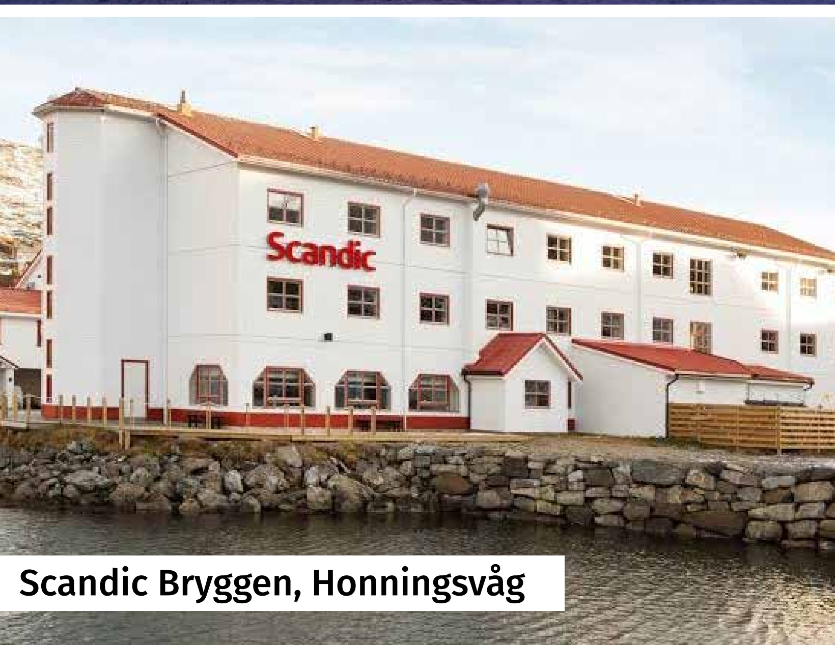
Scandic Bryggen, Honningsvåg