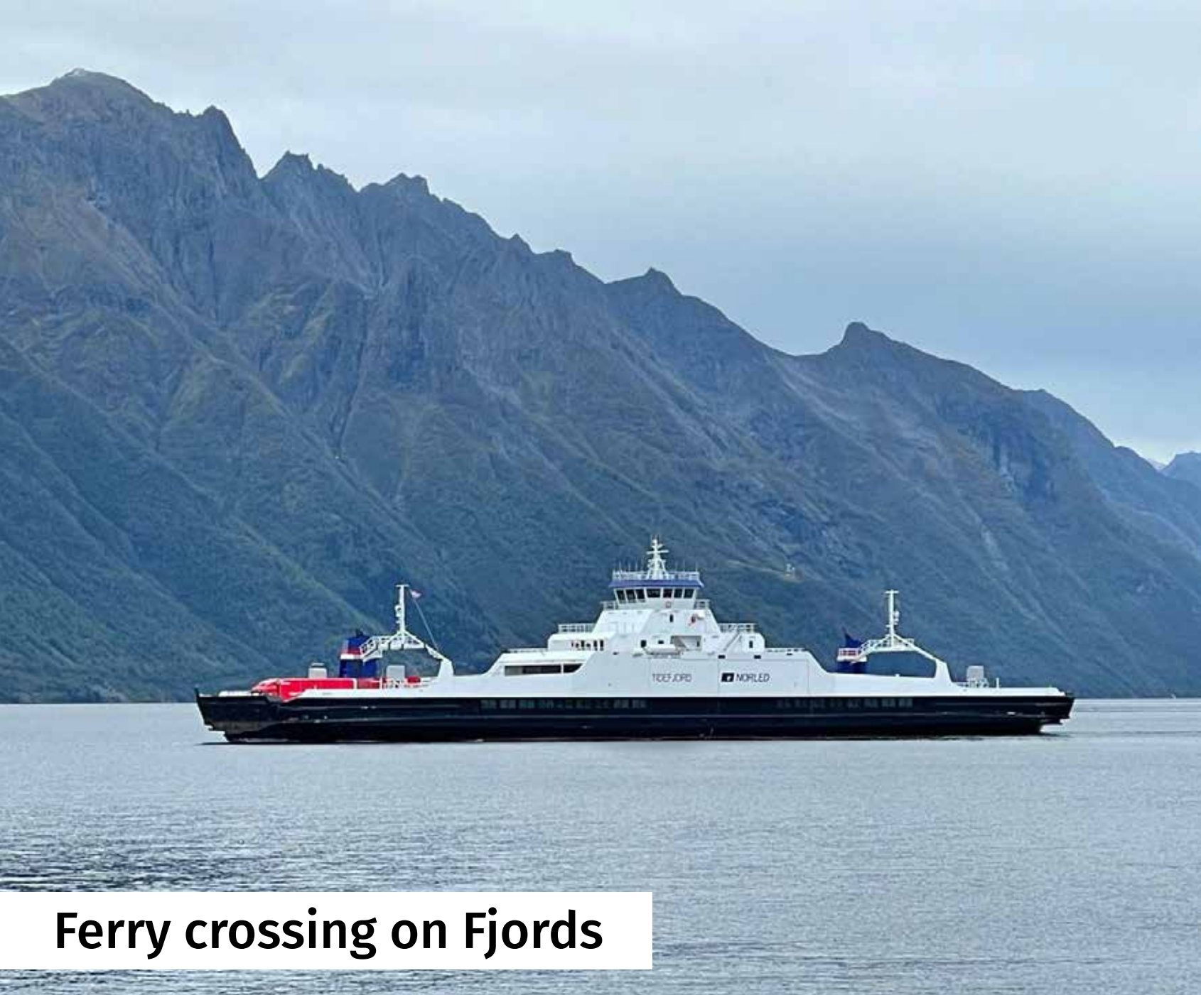
Ferry crossing on Fjords