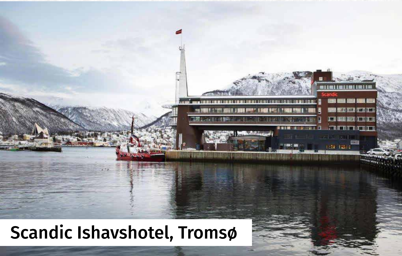
Scandic Ishavshotel, Tromsø