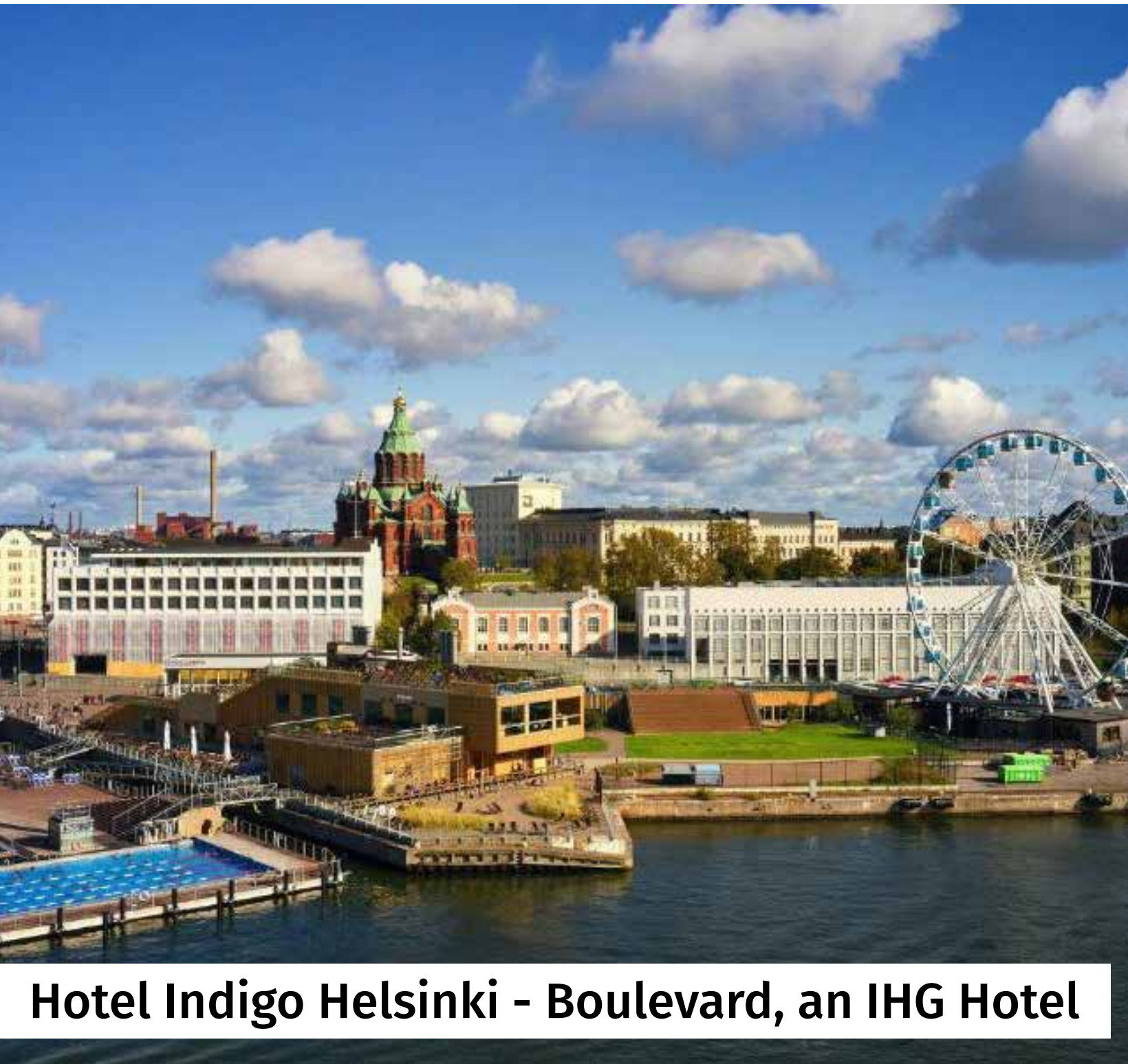
Hotel Indigo Helsinki - Boulevard, an IHG Hotel