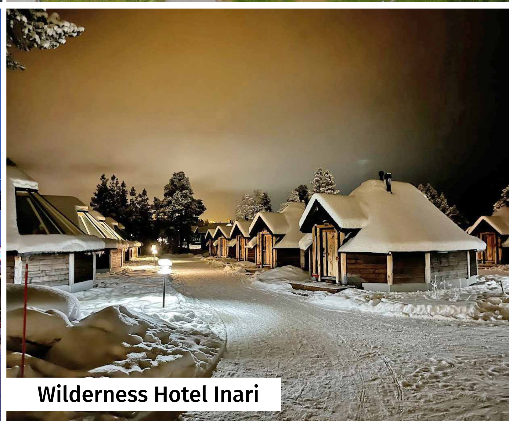
Wilderness Hotel Inari