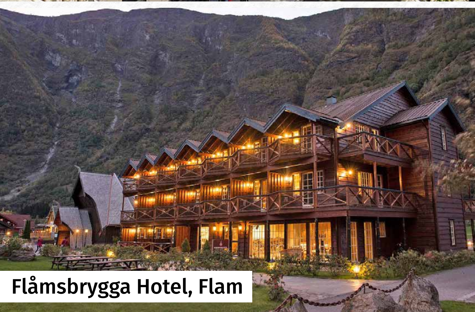
Flåmsbrygga Hotel, Flam