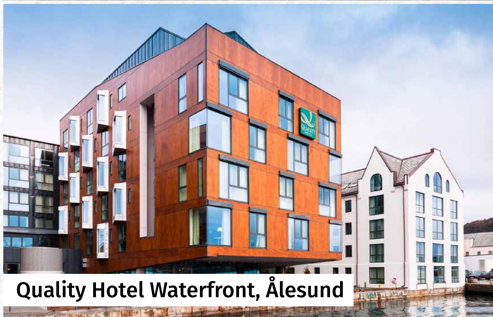
Quality Hotel Waterfront, Ålesund