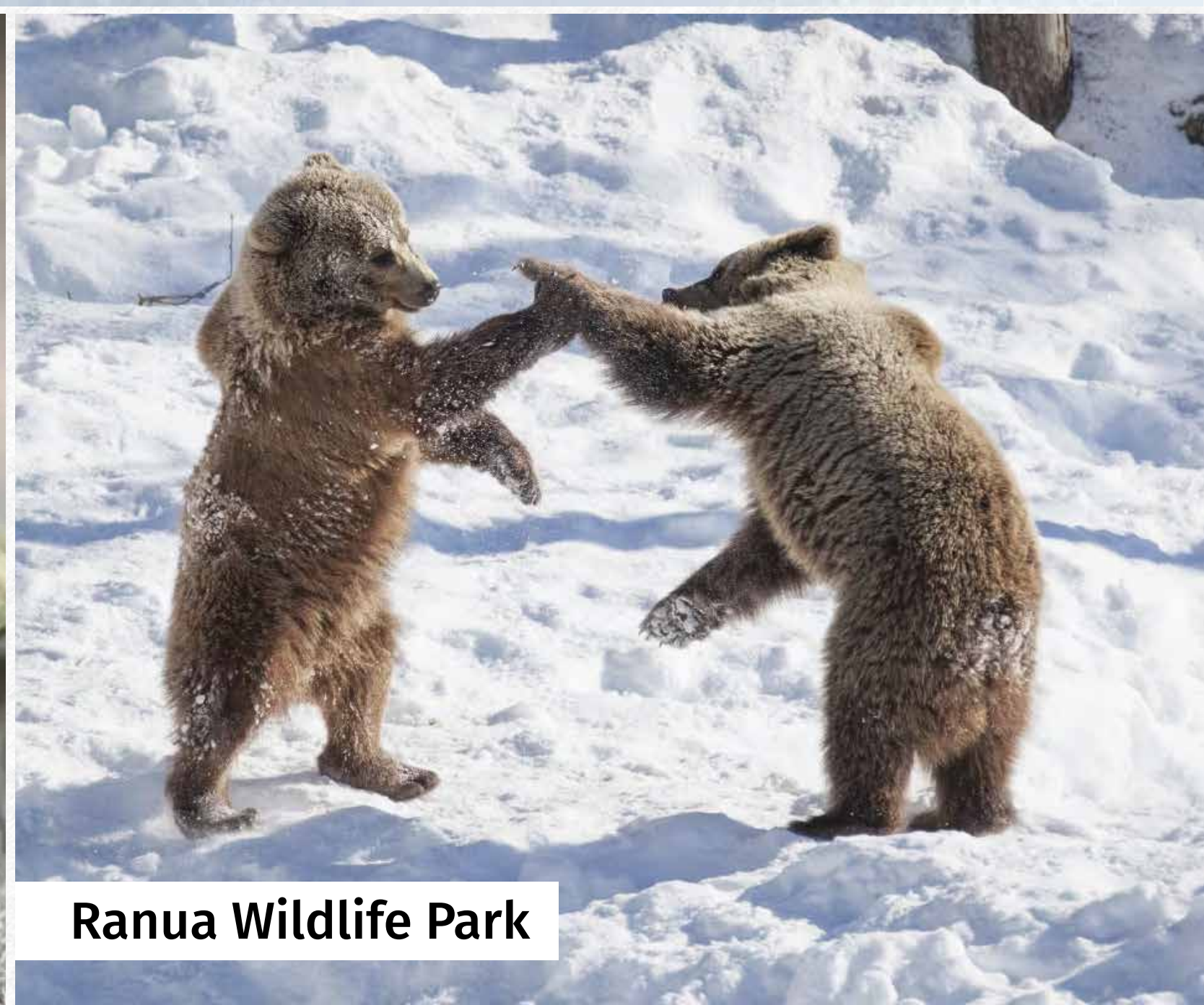
Ranua Wildlife Park