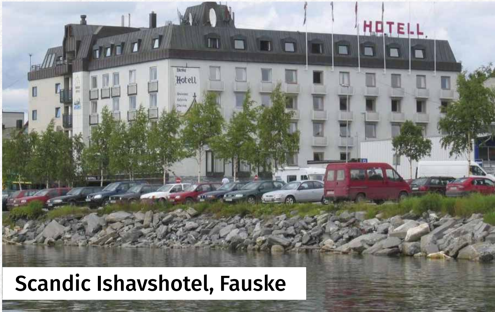
Scandic Ishavshotel, Fauske