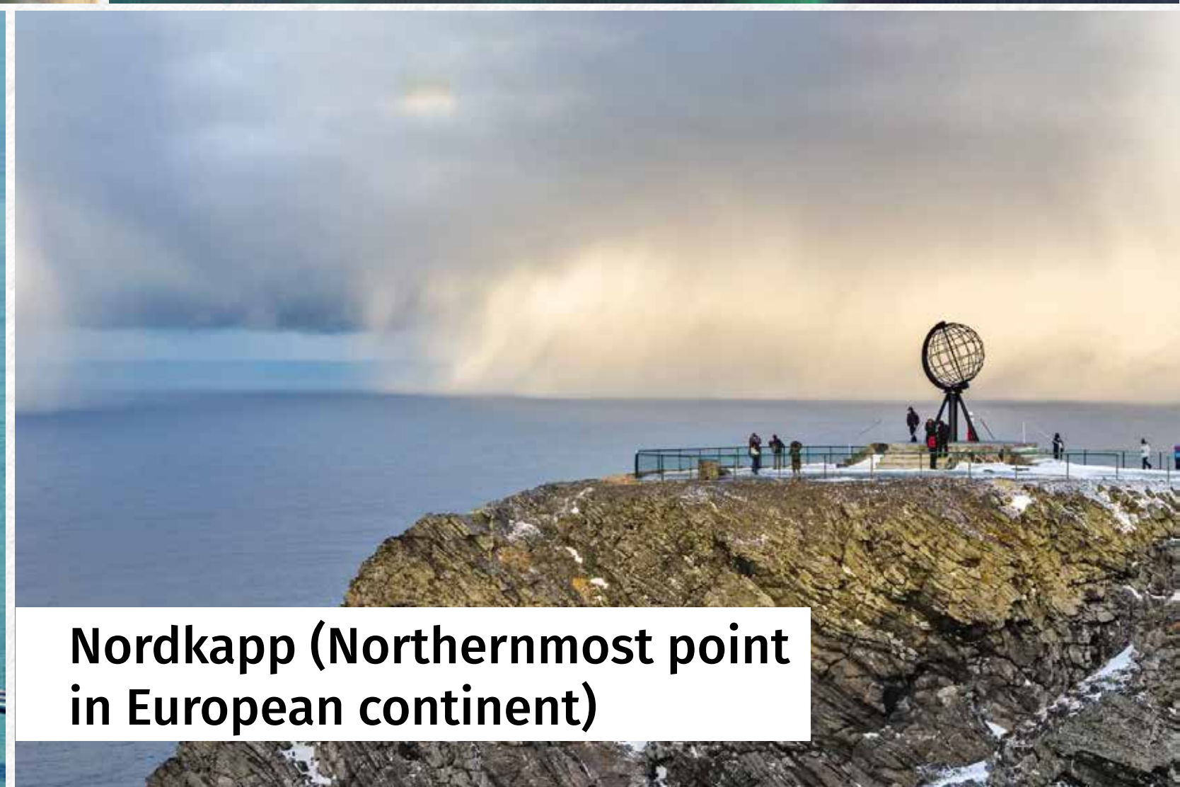
Nordkapp (Northernmost point in European continent)