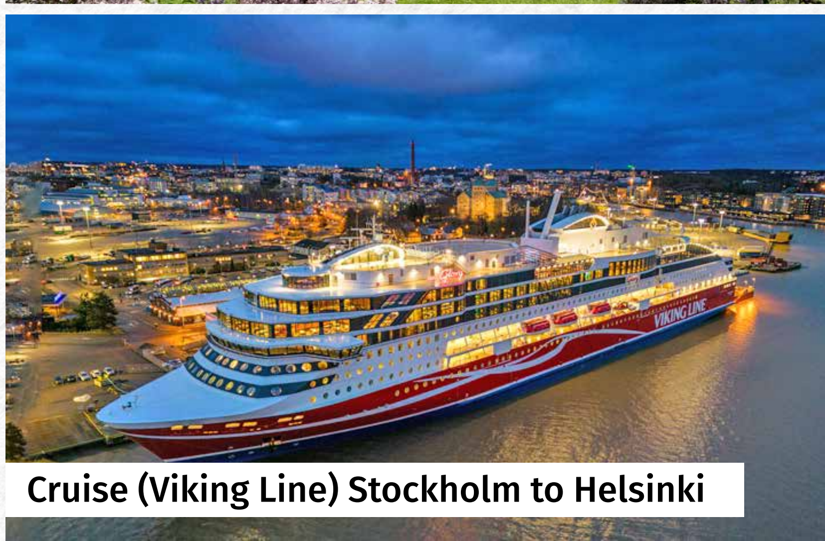
Cruise (Viking Line) Stockholm to Helsinki