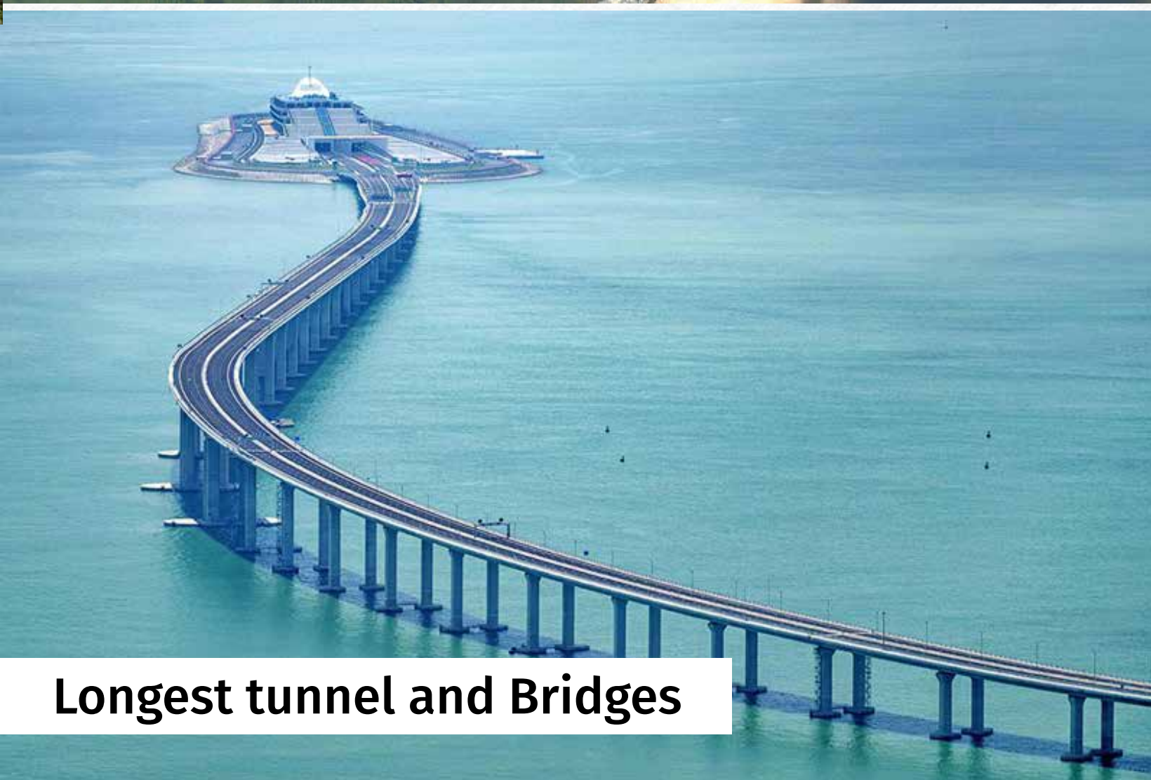
Longest tunnel and Bridges