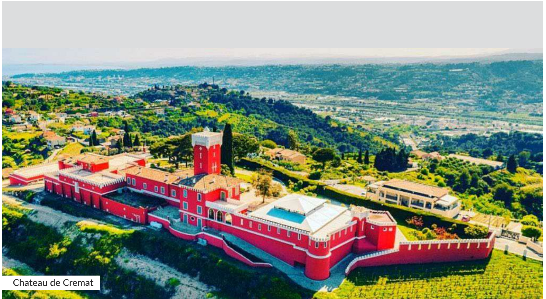
Chateau de Cremat

Begin your day with a leisurely morning, followed by a seamless transfer from the hotel to the enchanting Chateau Cremat. Immerse yourself in a refined wine-tasting experience and a captivating tour of the Chateau, gracing a picturesque plateau overlooking the Mediterranean. Delight in a palatable lunch featuring exquisite cheeses and cold cuts. Later, venture into town for a scrumptious dinner and retire for the night.