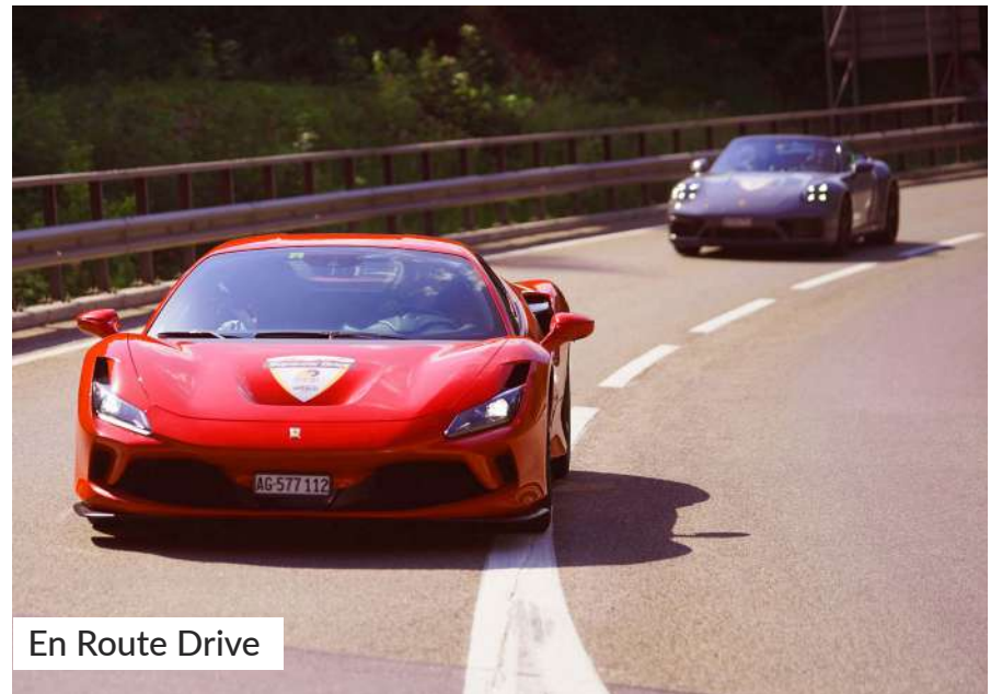
En Route Drive