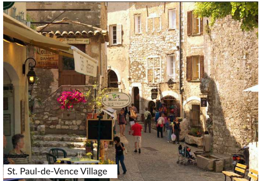
St. Paul-de-Vence Village