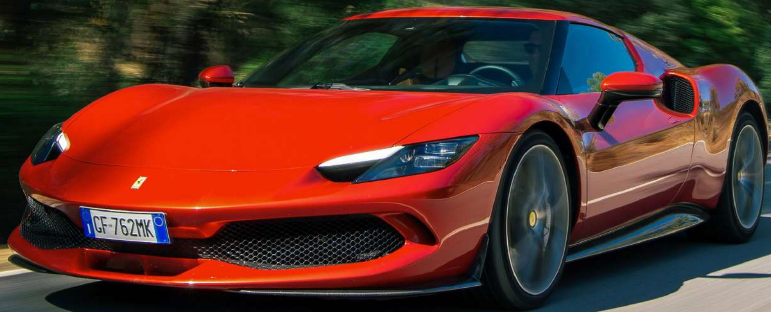
Ferrari 296 GTB, Hybrid