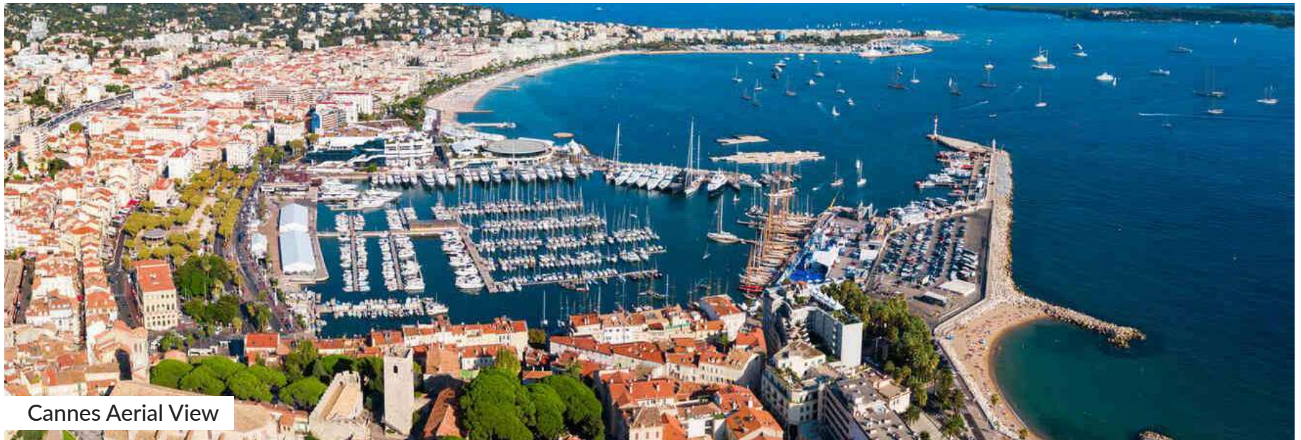
Cannes Aerial View