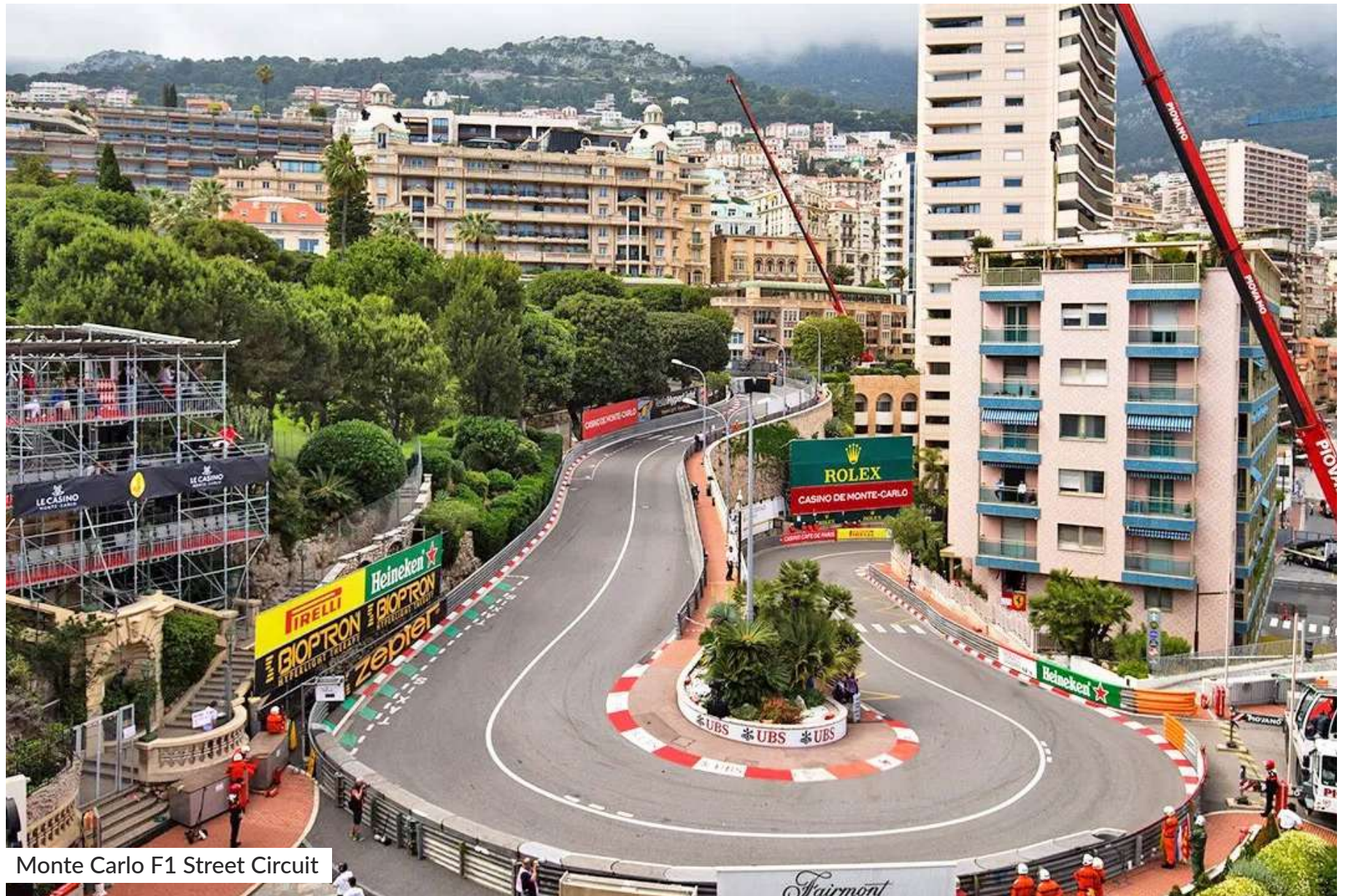
Monte Carlo F1 Street Circuit