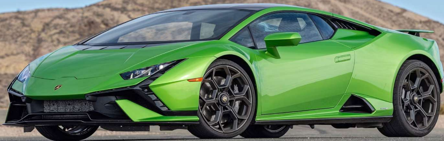
Lamborghini Tecnica Coupe