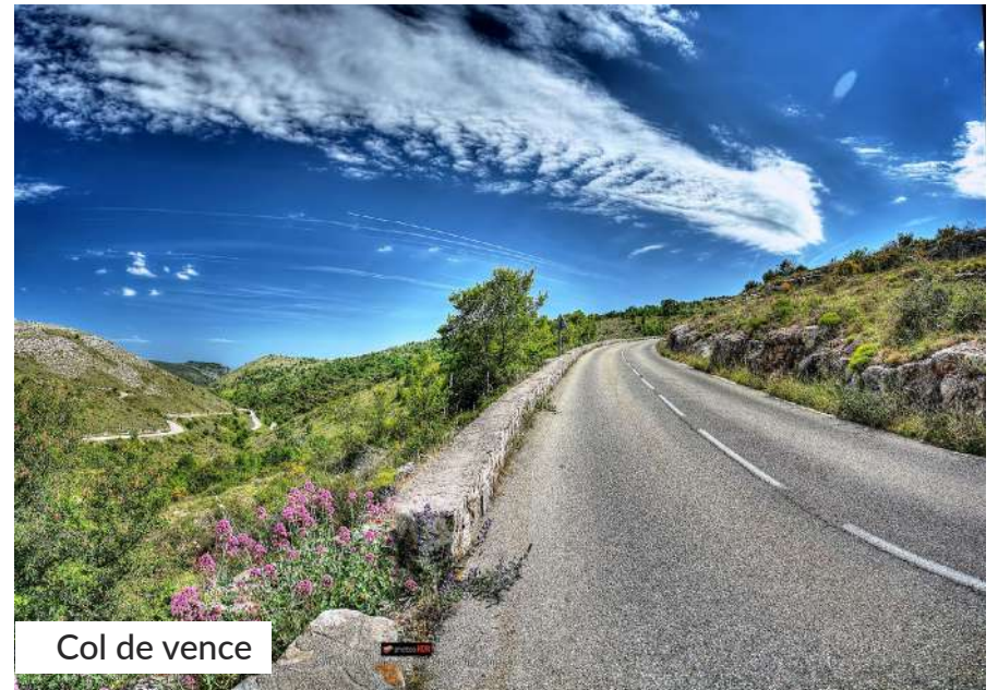
Col de vence