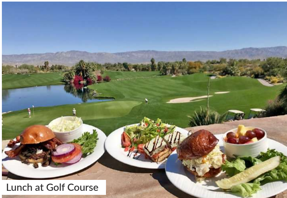
Lunch at Golf Course