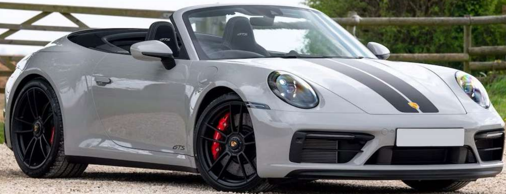
Porsche 992 GTS Cab