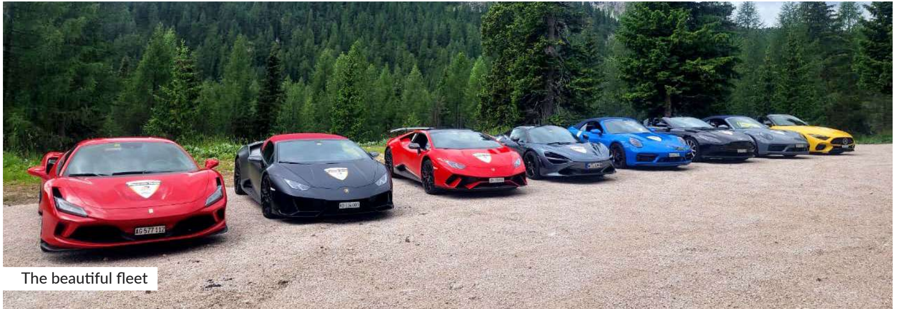
The beautiful fleet