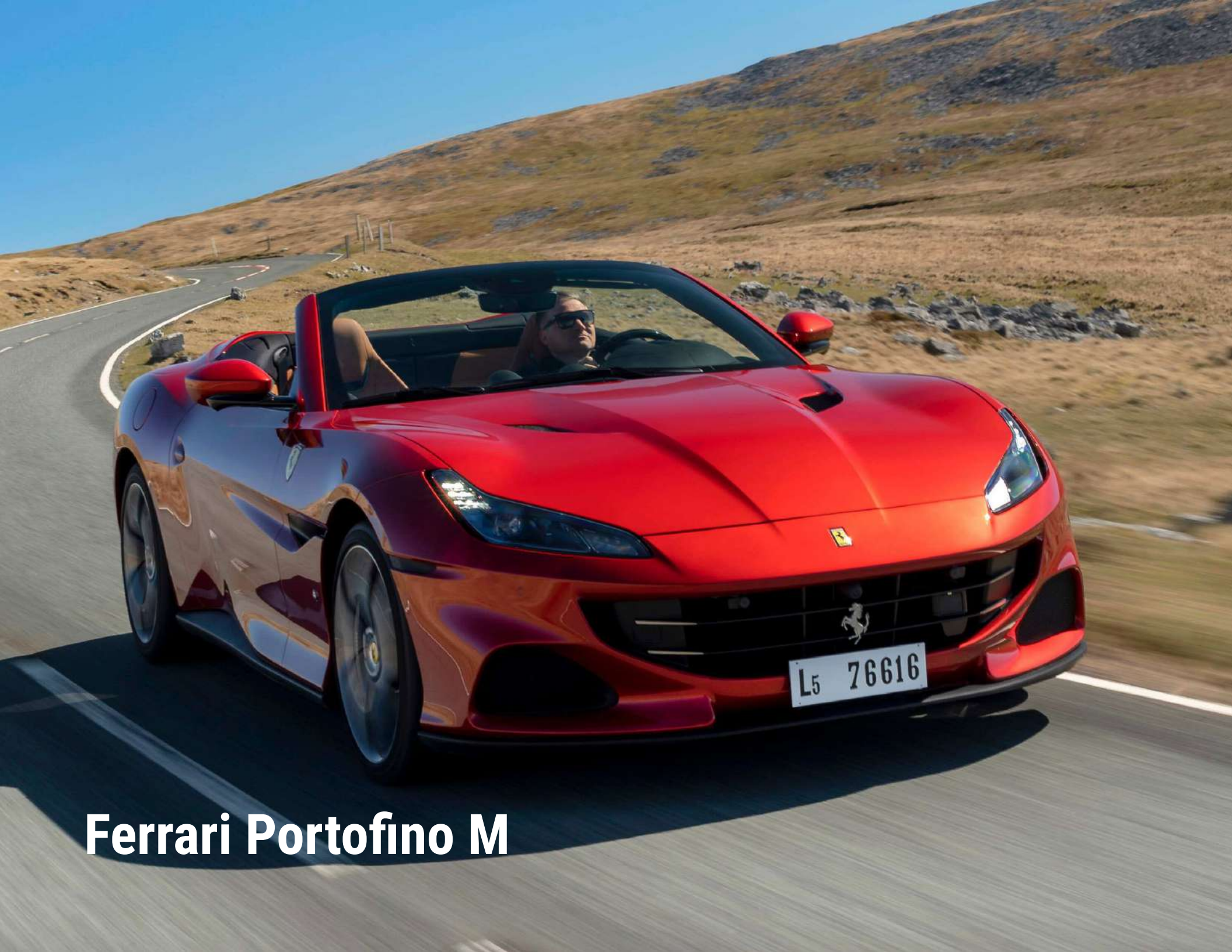
Ferrari Portofino M