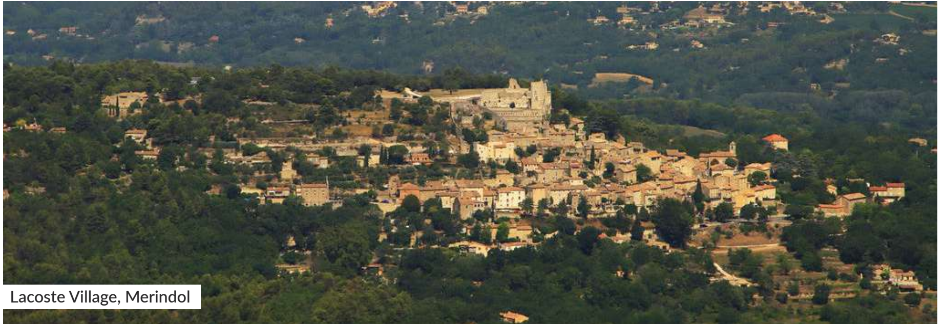
Lacoste Village, Merindol