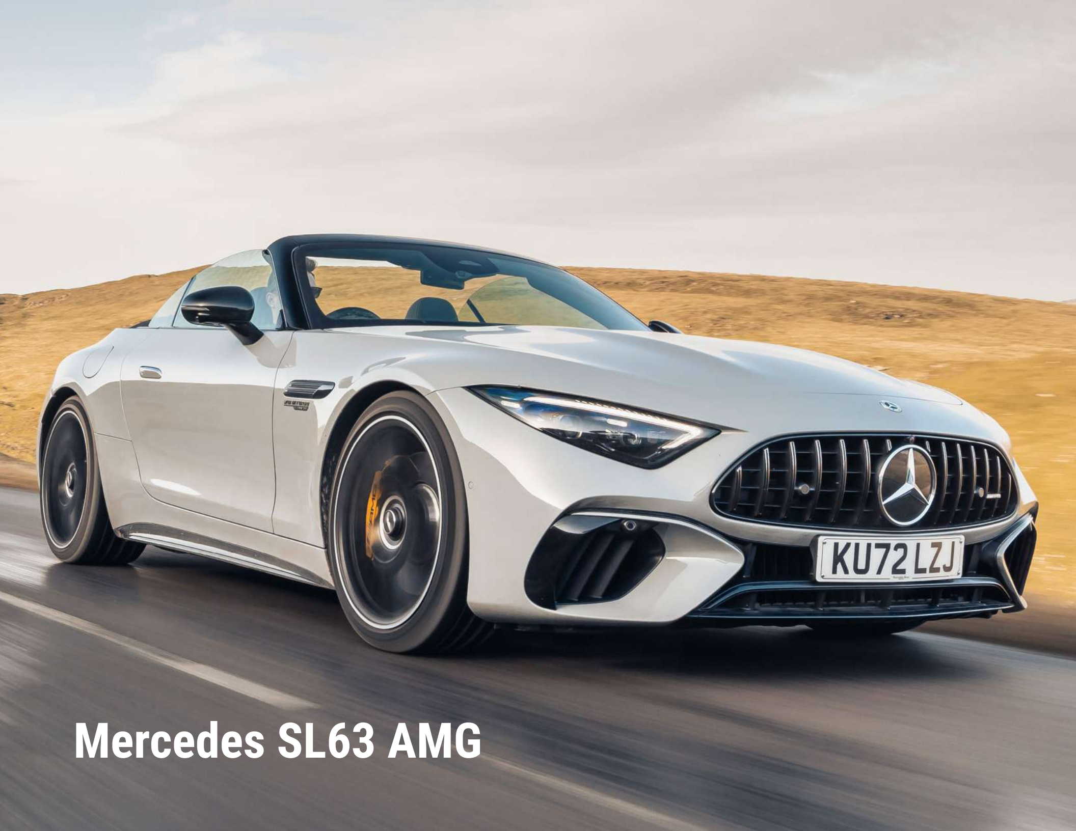
Mercedes SL63 AMG