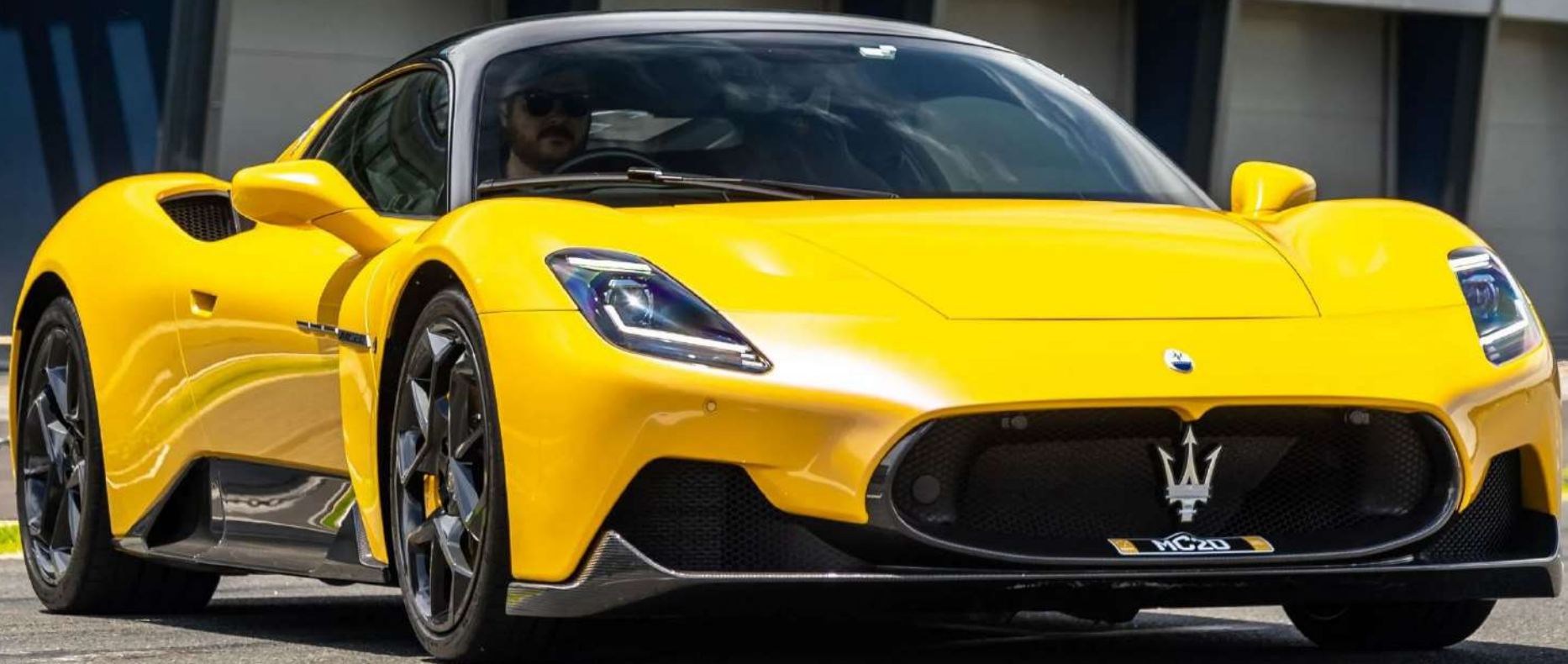
Maserati MC20 Cielo