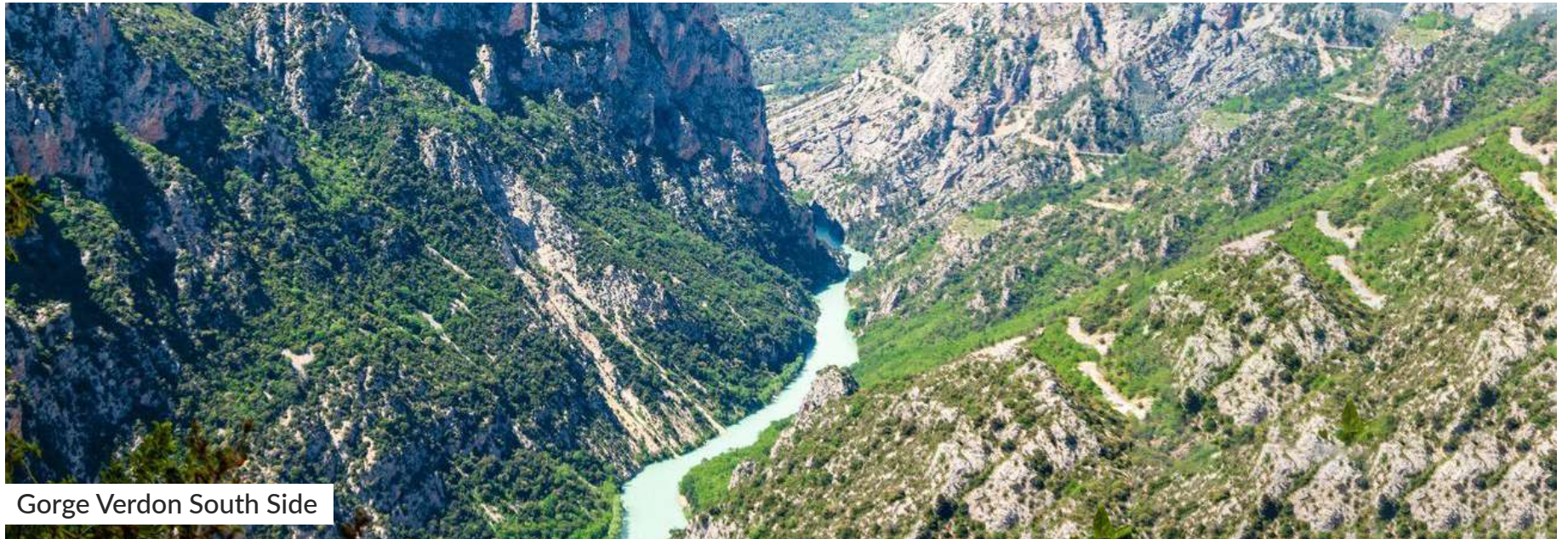
Gorge Verdon South Side