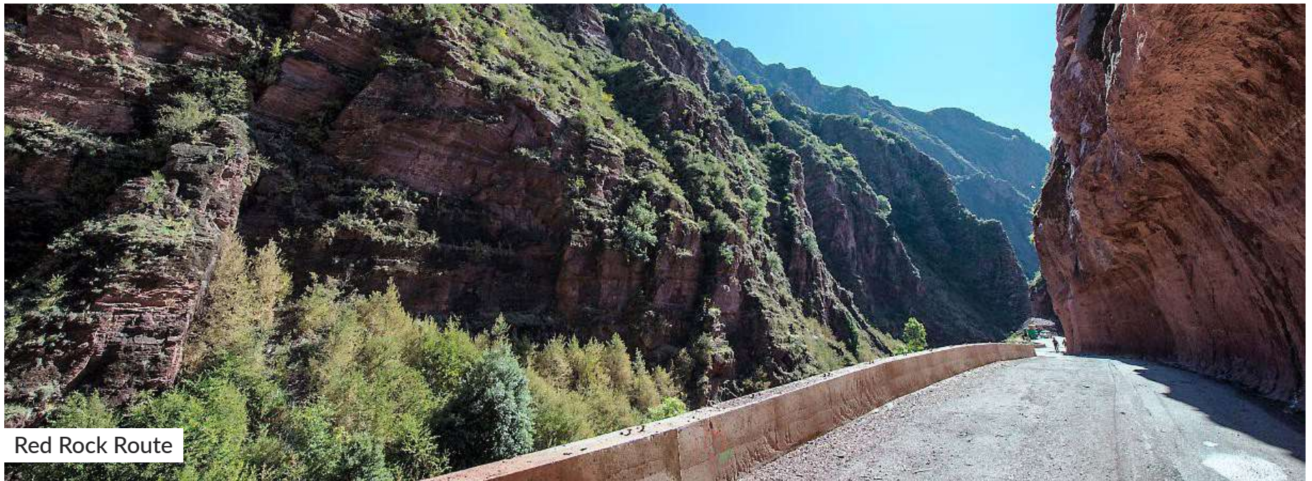
Red Rock Route

As the day winds down, the group will relax at the hotel’s spa, where pre-booked treatments will pamper and rejuvenate, allowing you to relive the exhilarating moments of the day in true luxury.