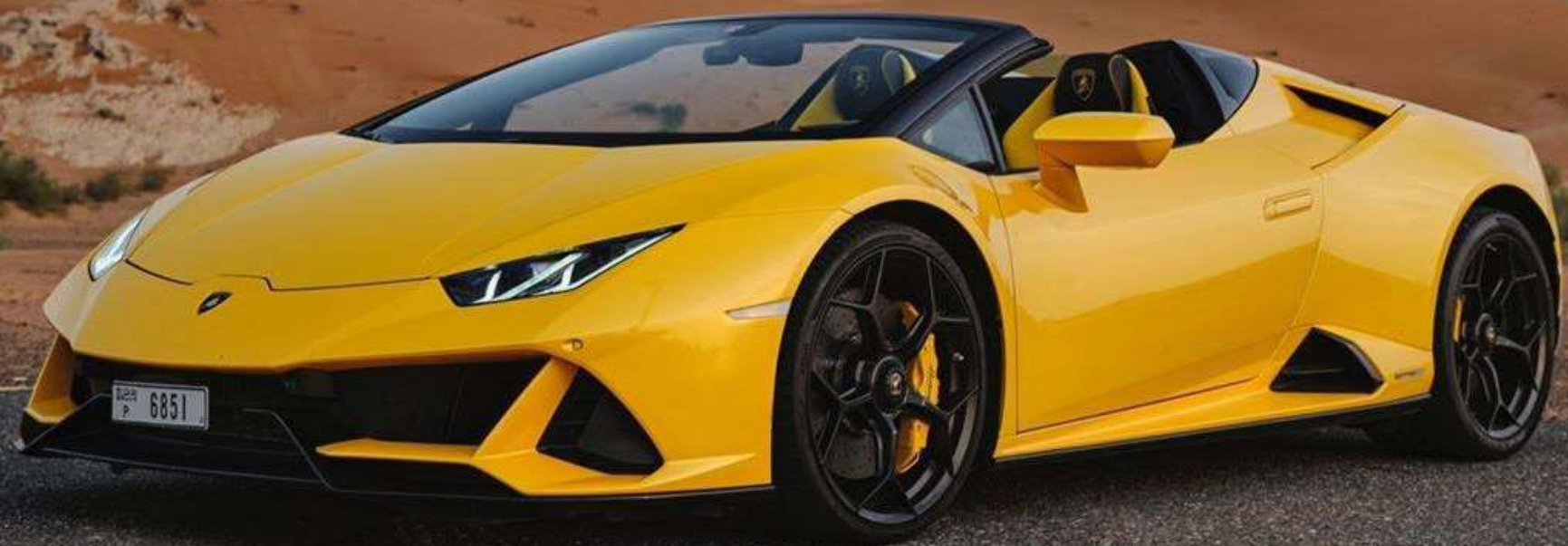
Lamborghini Huracan Evo Spyder