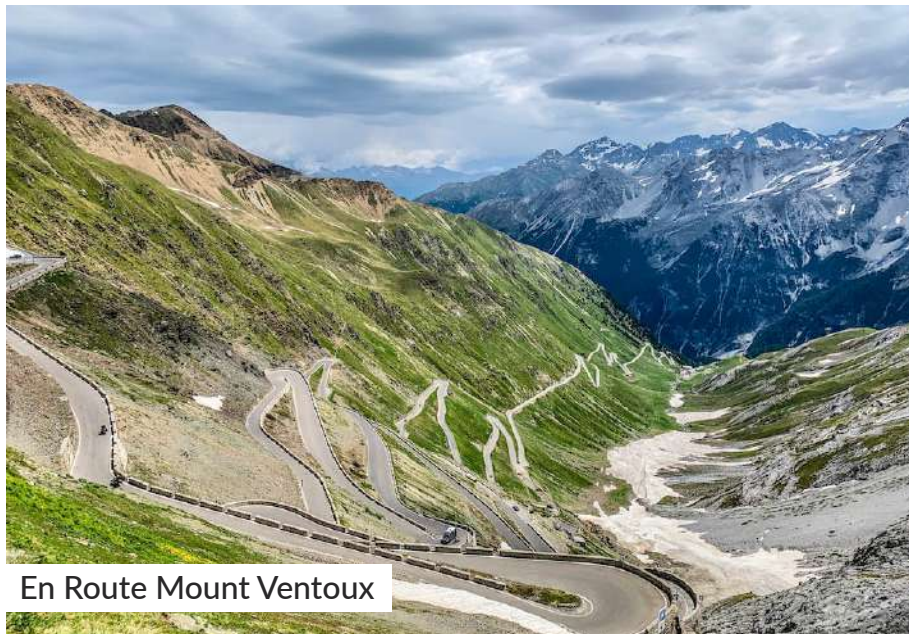
En Route Mount Ventoux