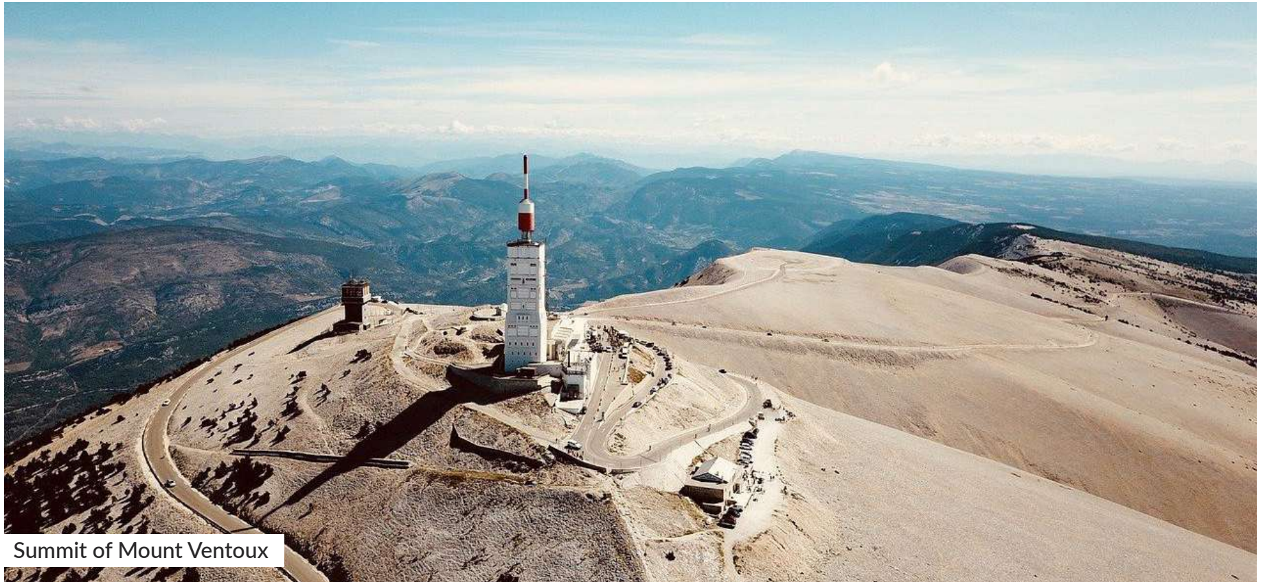
Summit of Mount Ventoux

Our adventure includes a château winery visit and exploring Gordes. Return to La Coquillade for spa relaxation and an optional wine tasting at the resort's winery.