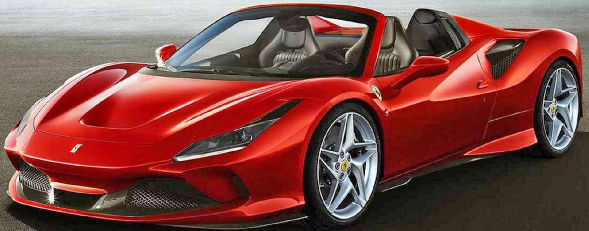
Ferrari F8 Spider