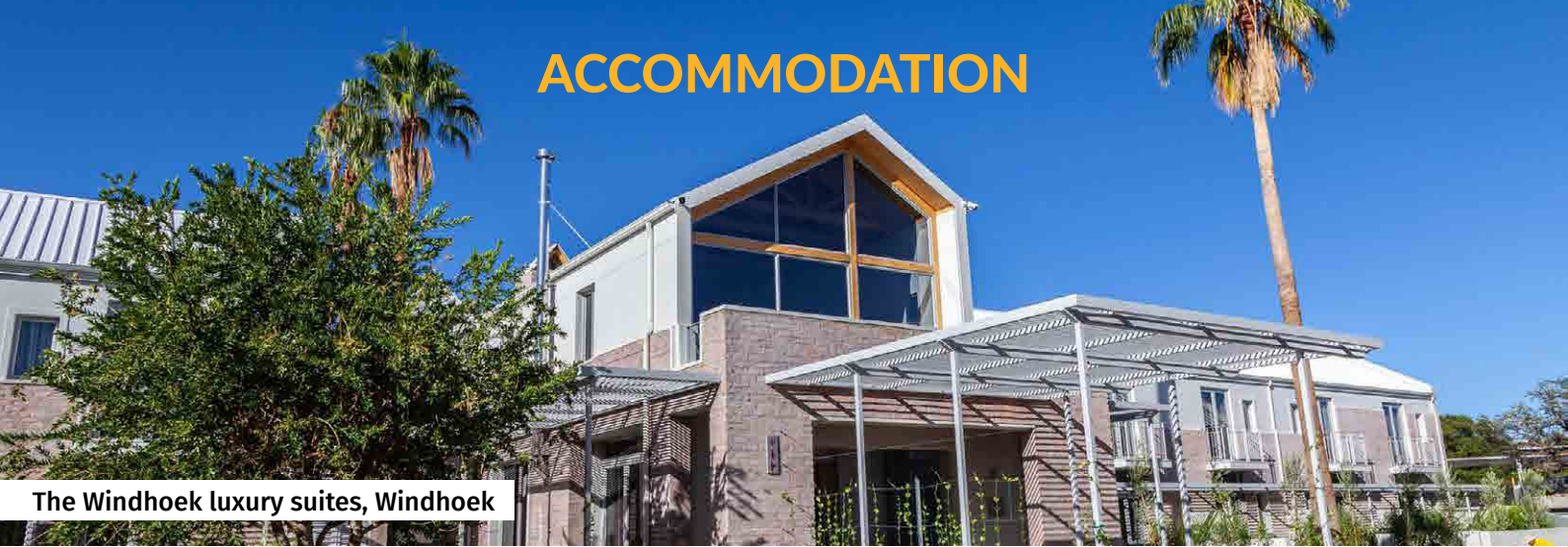
The Windhoek luxury suites, Windhoek