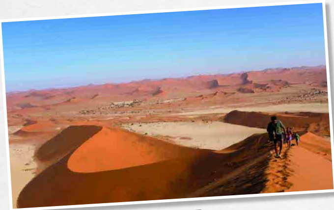
Big Daddy Dune