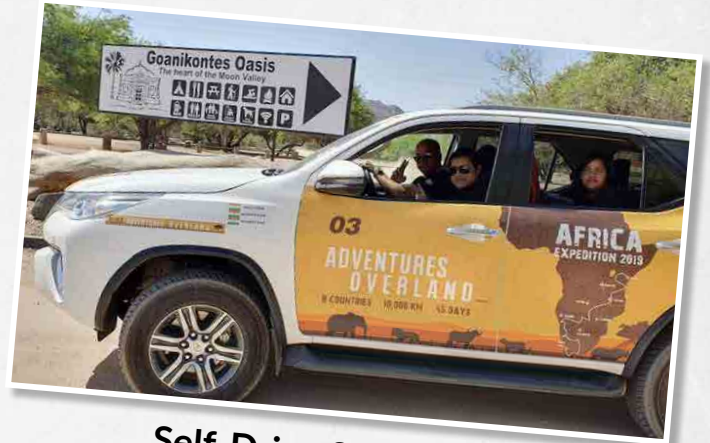
Self-Drive SUV Vehicle