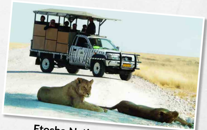
Etosha National Park South