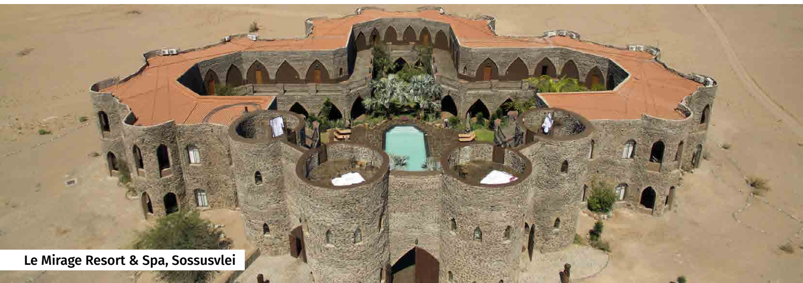
Le Mirage Resort & Spa, Sossusvlei