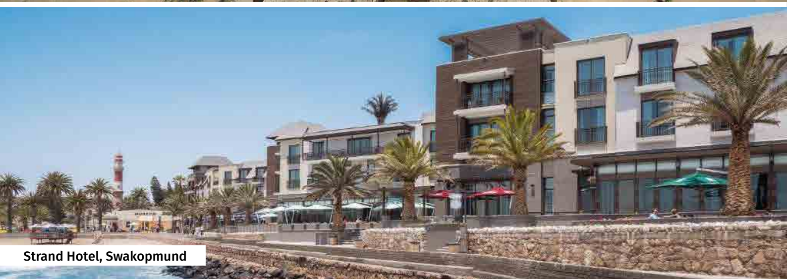
Strand Hotel, Swakopmund