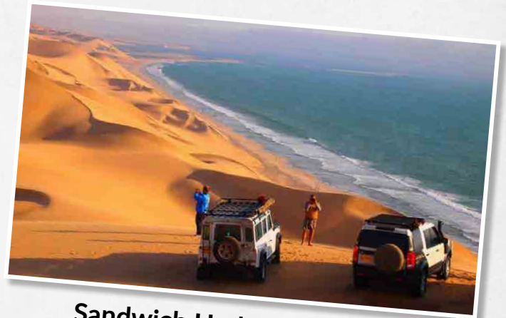
Sandwich Harbour Excursion