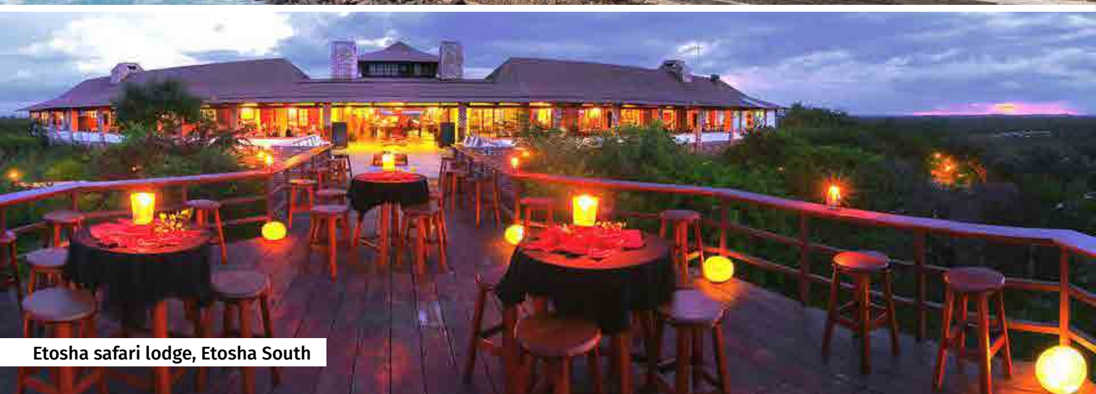
Etosha safari lodge, Etosha South