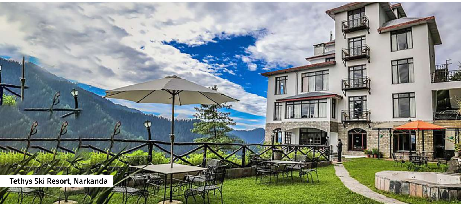
Tethys Ski Resort, Narkanda