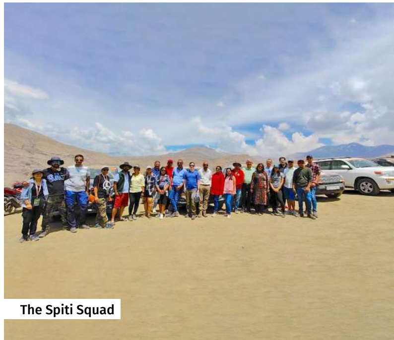
The Spiti Squad