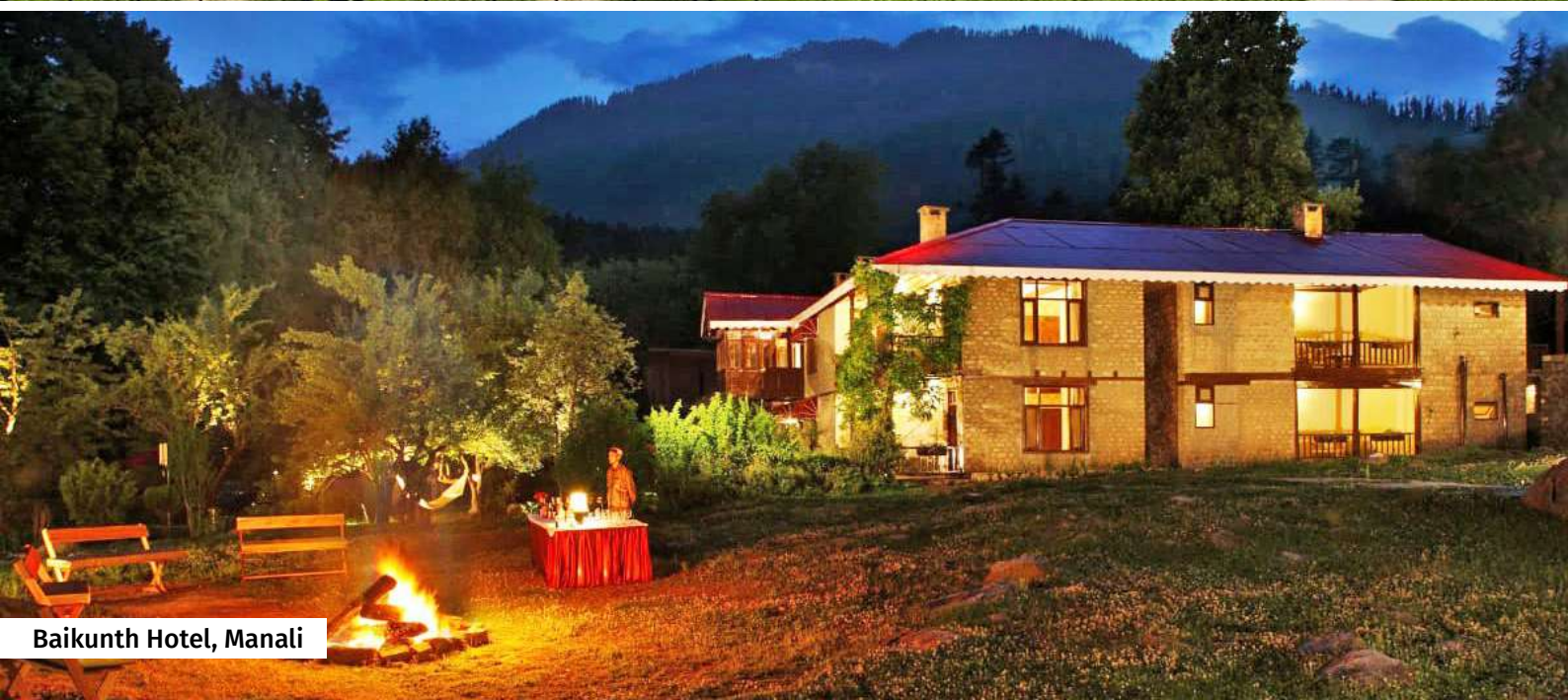
Baikunth Hotel, Manali