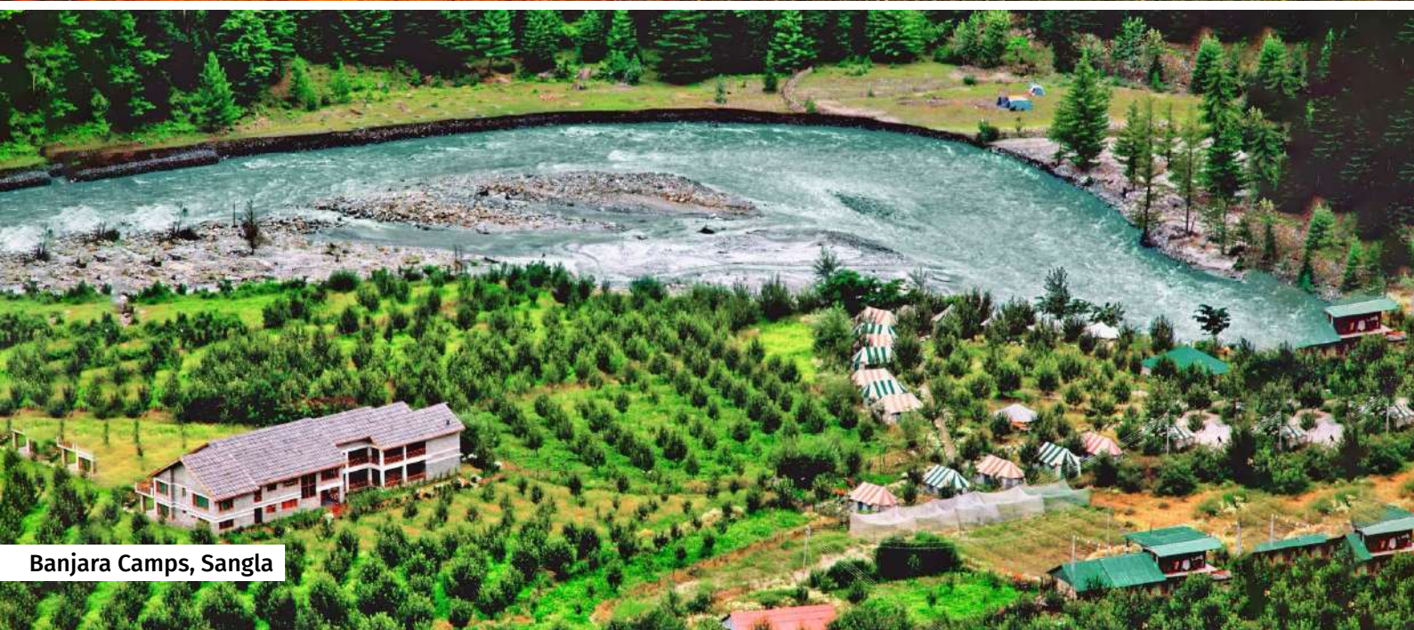
Banjara Camps, Sangla