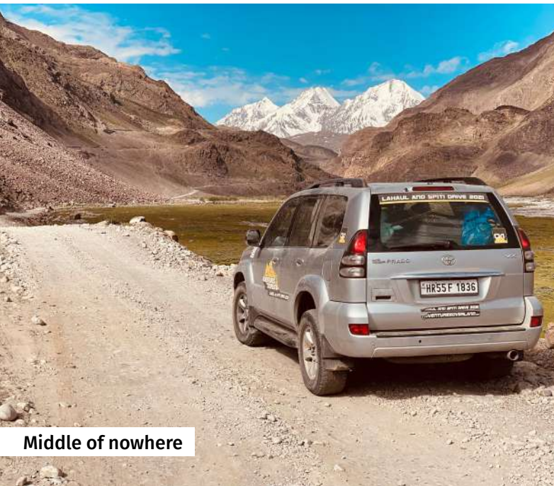
Middle of nowhere